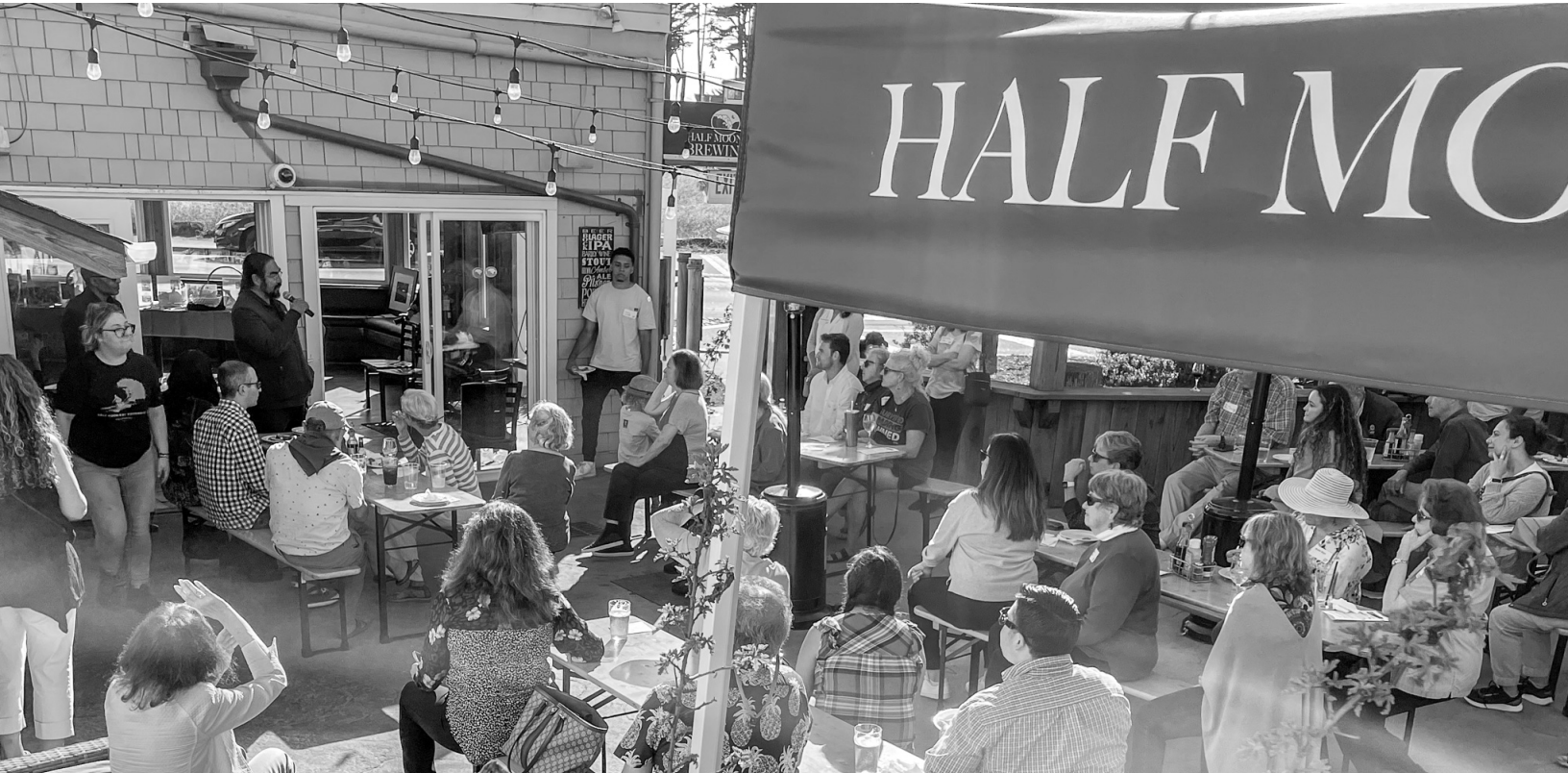
Fixers and supporters at the Half Moon Bay Brewing Company

Fixin' San Mateo County is a local grassroots organization working to enact effective, independent civilian oversight of the County Sheriff's Office.