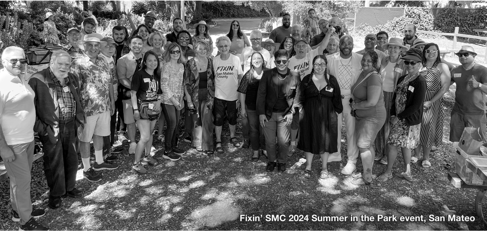
Fixin' SMC 2024 Summer in the Park event, San Mateo

Fixin' San Mateo County is a local grassroots organization working to enact effective, independent civilian oversight of the County Sheriff's Office.