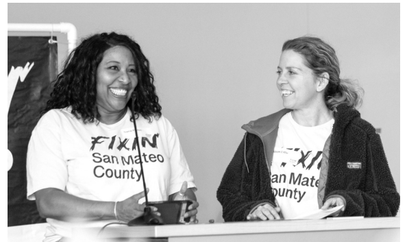
Our spring 2024 event in South San Francisco