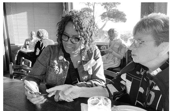
Supporters at our fall event in Half Moon Bay